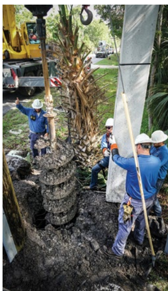
Crews replace wooden poles with concrete to withstand higher winds.

Since 2008, all new primary power lines have been constructed to withstand 120 mph winds.